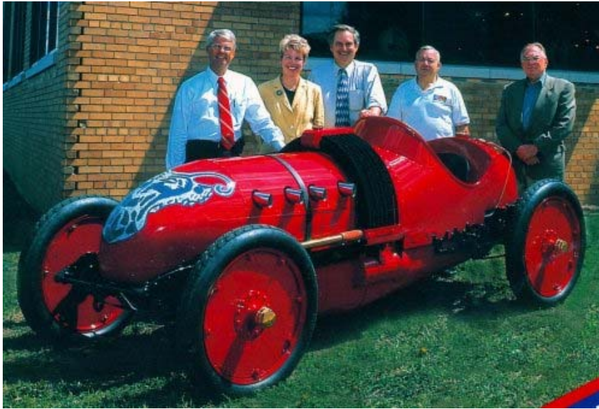
2001 - The Buick Gallery and Research Center at The Sloan Museum, Flint, Michigan.

of documents that might otherwise have been lost to automobile history. He then oversaw their packing and transportation to the Buick Gallery and Research Center of the Sloan Museum in Flint.